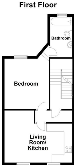
Not to scale. For illustrative purposes only

Flat 1 30 Hazelwood Road, Northampton, NN1 1LN